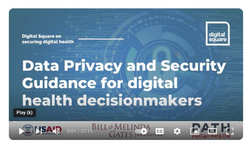
Sign up here to receive notifications for upcoming webinars.